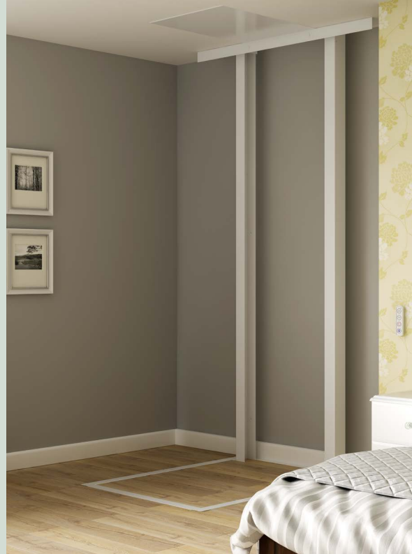
Upper floor when your Stratum is downstairs