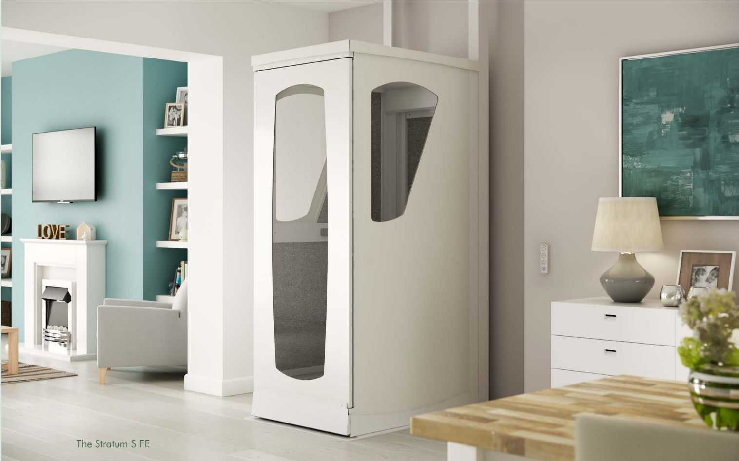
The Stratum S FE

The Stratum homelift has been designed to be as flexible to install as possible. Its self-supporting structure means that it doesn't require any major structural alterations for it to be installed and can be fitted practically anywhere in your home. There's no lift shaft, so your Stratum homelift looks stylish and compact when it is in the room and leaves a feeling of space when it is sent up or down.