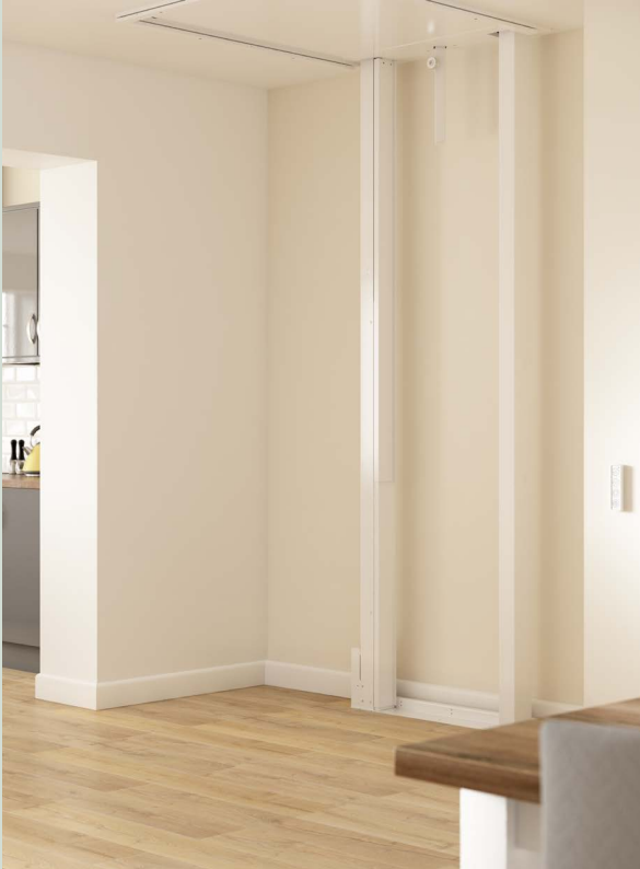
Lower room when your Stratum is upstairs