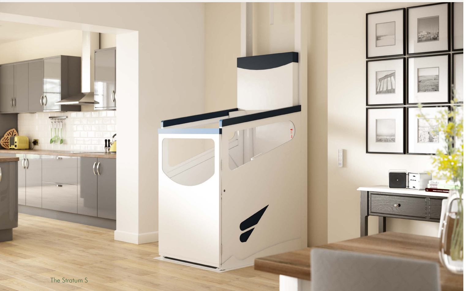
The Stratum S

Imagine the convenience and luxury of a lift in your own home. A lift that takes up surprisingly little space and that makes life so much easier from the moment it's installed. Whether you have an immediate need for easy vertical access or are looking to the future, our Stratum homelift simply allows freedom in your own home.